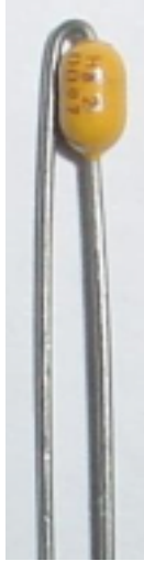
Vertically Mounted Capacitor