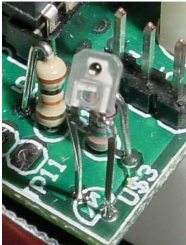
Right PT480 Phototransistor Mounting